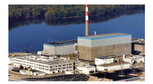
The Exelon Quad Cities Nuclear Station in the U.S. uses Pacific pumps as reactor feed pumps. The reactor feed water is sealed by an EagleBurgmann type DF-SAF5/133-ET1 mechanical seal. Operating conditions: p = 31 bar (450 PSI); t = 281 °C (538 °F); n = 4.500 min<sup>-1</sup>.